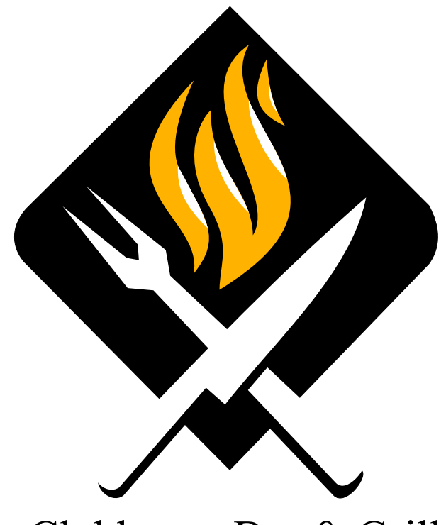
Clubhouse Bar & Grill At Greensburg Country Club

Hours of operation are Wednesday and Thursday after league play and Saturday and Sunday from 10-2.